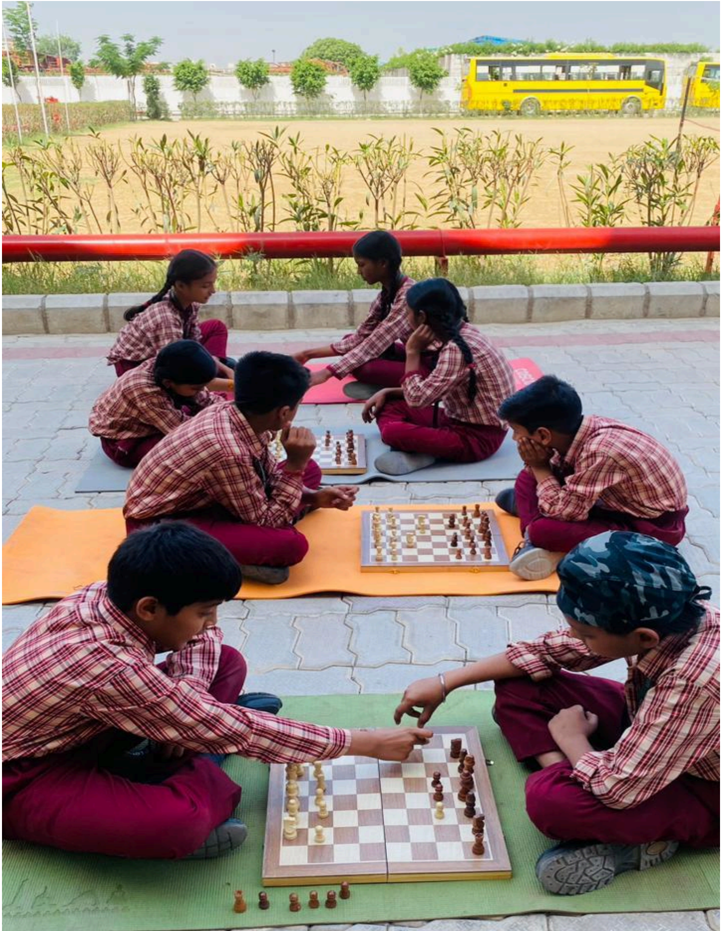
Lotus Petal Senior Secondary School, Khasra No. 12/2, Dhunela-Berka Road, Village Dhunela, Sector-31, Tehsil Sohna, Gurgaon - 122103, Haryana (India)